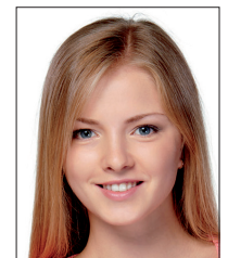
6 Tooth Smile

We believe that your orthodontist creates the best smiles. Clear21 braces gives your orthodontist the tools they deserve.