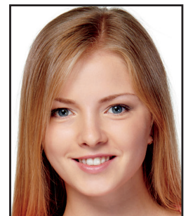
6 Tooth Smile

We believe that your orthodontist creates the best smiles. Clear21 braces gives your orthodontist the tools they deserve.