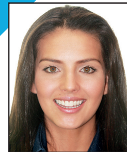
12 Tooth Smile

The Clear21's patient friendly design has no sharp edges and is specially designed to move teeth FASTER and with LESS force and discomfort.